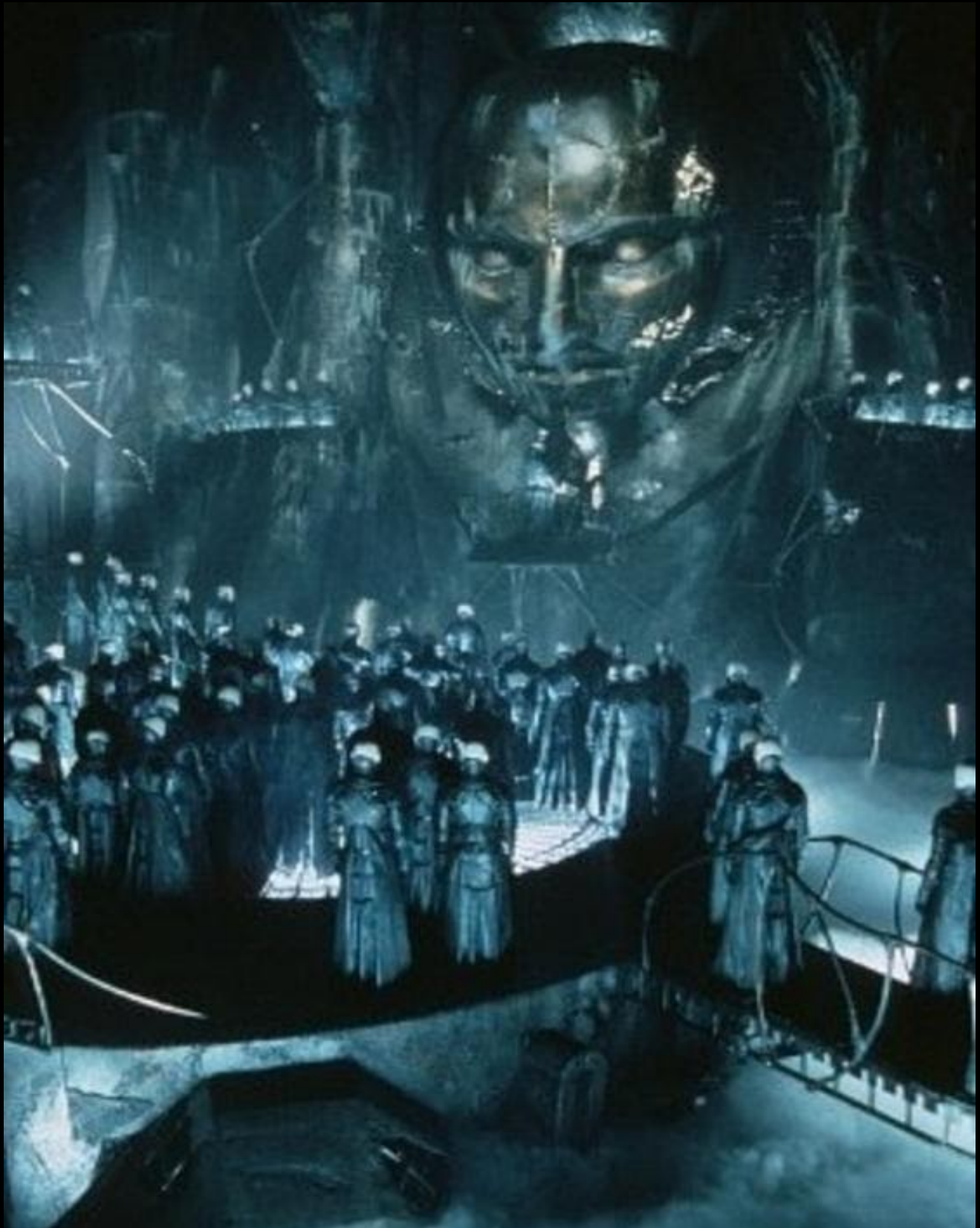
IMAGE OF THE BEAST