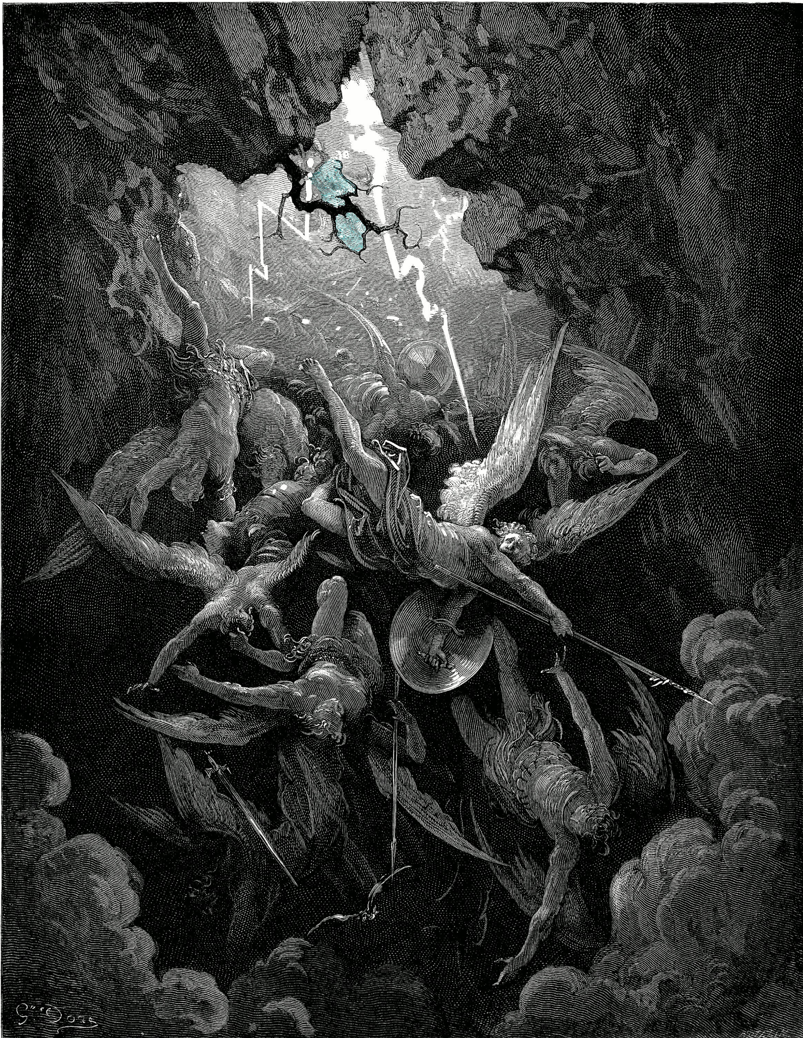
Illustration by Gustave Doré to John Milton's "Paradise Lost", Book VI, 1866