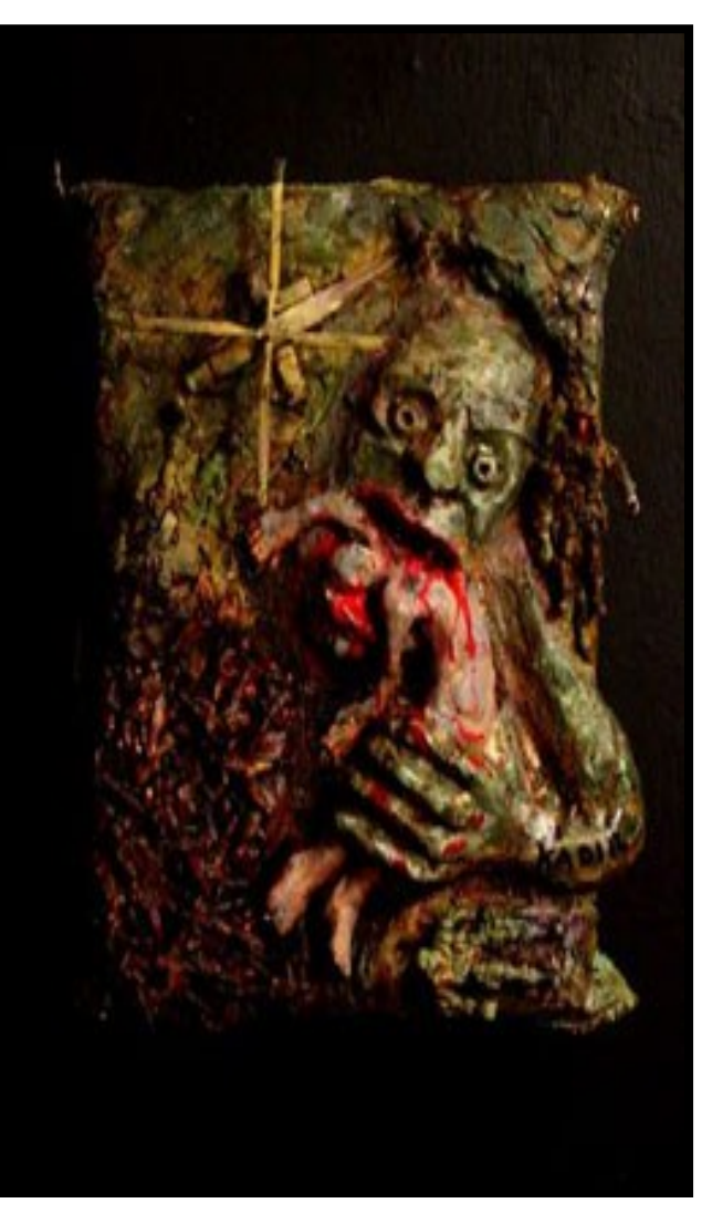
1 Snoch 7:4–5 "The giants turned against them and devoured mankind. And they began to sin against: birds, and beasts, and reptiles, and fish, and to devour one another's flesh, and drink the blood." R. Charles